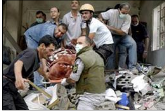
Daily dealing with acts of Israel's wars