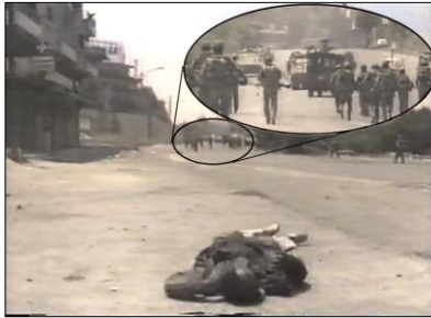
Beirut 1982, Israeli soldiers walk away from Lebanese man they shot dead.