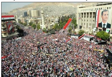
Assad government solidarity demonstration 12 October 2011, Damascus.