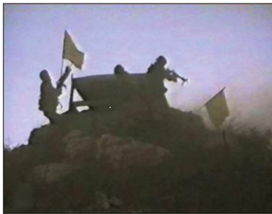
29 June 1996, Hezbollah Resistance fighters storm the Israeli Occupation

Military Outpost at Ahmadia, constructed in 1982.