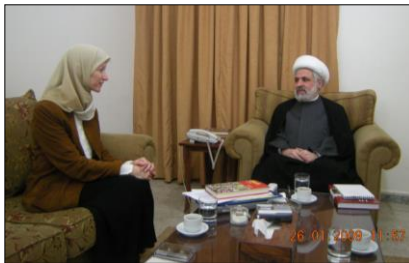
Meeting with Sheik Naim Qassem, January 2009