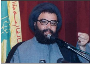
Hezbollah Secretary General Sayyed Abbas al-Moussawi (May 1991—Feb 1992)