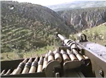
The machinery of Israeli Occupation