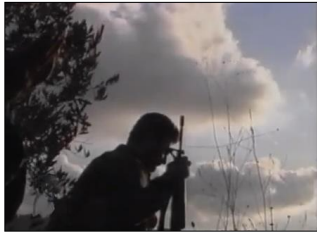
Reflection of a Resistance fighter

For the benefit of man Not bravado, but belief Sharing Leaving: Principle and practice The essence of jihad Think Again