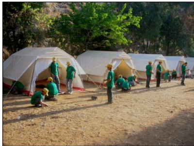
Typical Mahdi Scout camp

New York strikes out A question of integrity Circulation Context Using Photographs The headline: a look at language Discourse of the text itself Tangible impact Meeting Mahdi Scouts: Beirut Office Meeting Mahdi Scouts: Scout City A Question of Credibility Perspective