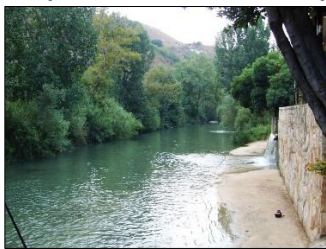
The Litani at Al-Qa'qa'iyah