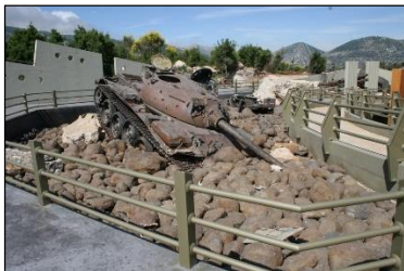
Mleeta Resistance Museum