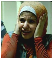
The impact of Israeli bombing