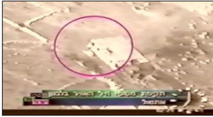
Israeli television broadcast of their counter-mission